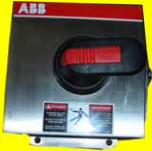
ABB no fuse stainless