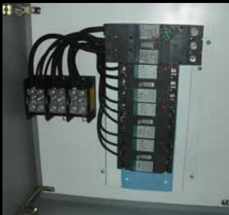
Distribution Block Panel (DBP) Smaller, Cheaper, Faster Delivery for panels That only need a few breakers 400 amp mlo 12 cirucits