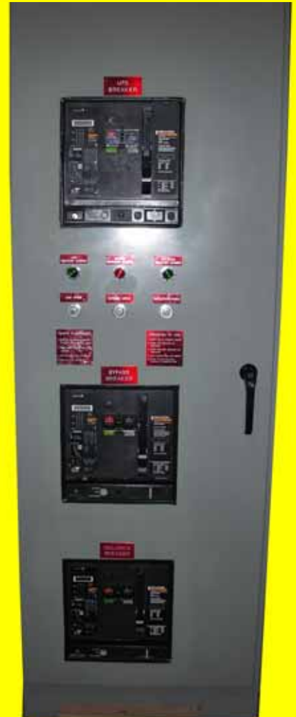
Maintenance bypass switch 2000 amp drawout