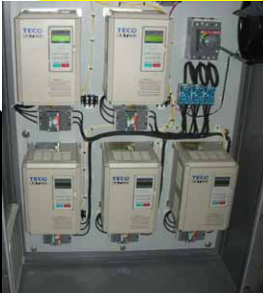
Drive with viewing window