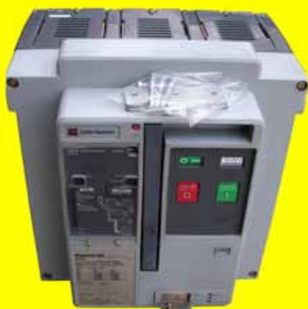
Circuit Breaker Rentals