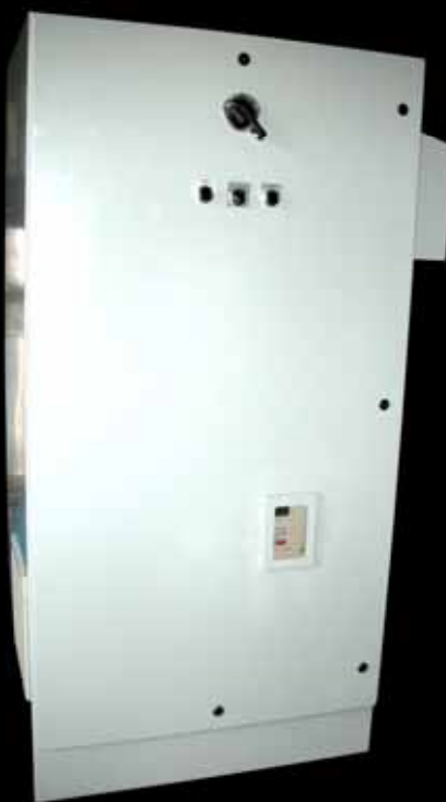
VFD Drive Rental