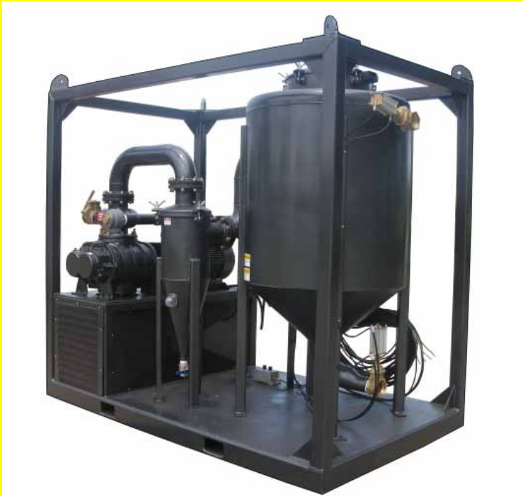
Industrial Vacuum 50 HP Explosion Proof