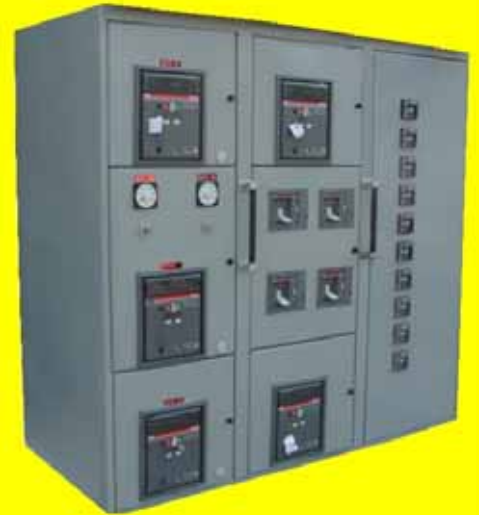
Main tie main marine Board built in 7 days from purchase order

Explosion Proof Fiberglass Stainless Steel Painted Steel With Starters Specific Dimensions Retrofits Power Buildings Rentals