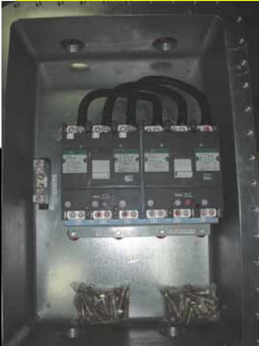
Explosion Proof 600 Amp Transfer Switch