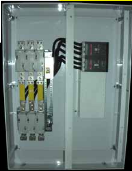
Transfer Switch with Built in Distribution

Explosion Proof Fiberglass Stainless Steel Painted Steel With Starters Specific Dimensions Retrofits Power Buildings Rentals