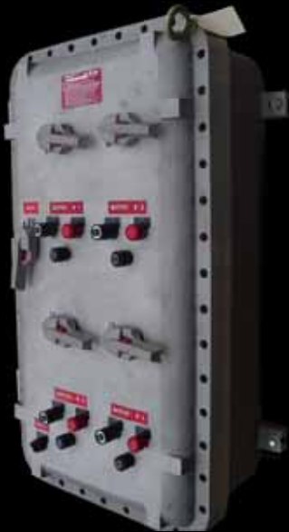
Explosion proof Panel Multistarter